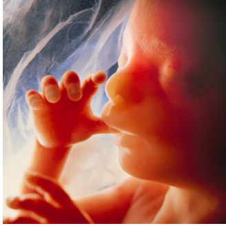
(Unborn Baby 18 Weeks)

To our Country Supervisors, State Legislators, and all Public Officials: