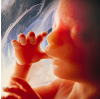
(Unborn Baby 18 Weeks)

To our Country Supervisors, State Legislators, and all Public Officials: